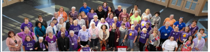
Delegation members after District Caucus